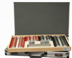
Trial Lens Set

For more high-quality diagnostic equipment & accessories, visit s4optik.com